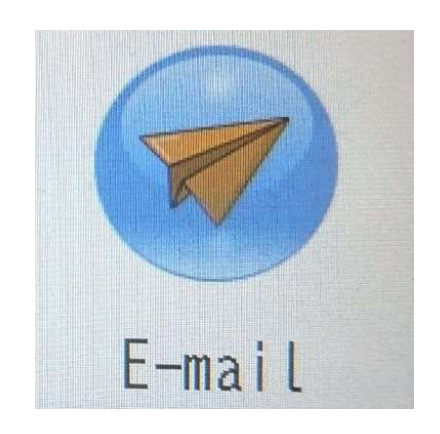
Print documents sent to pullprint-queue or Mprint.uib.no